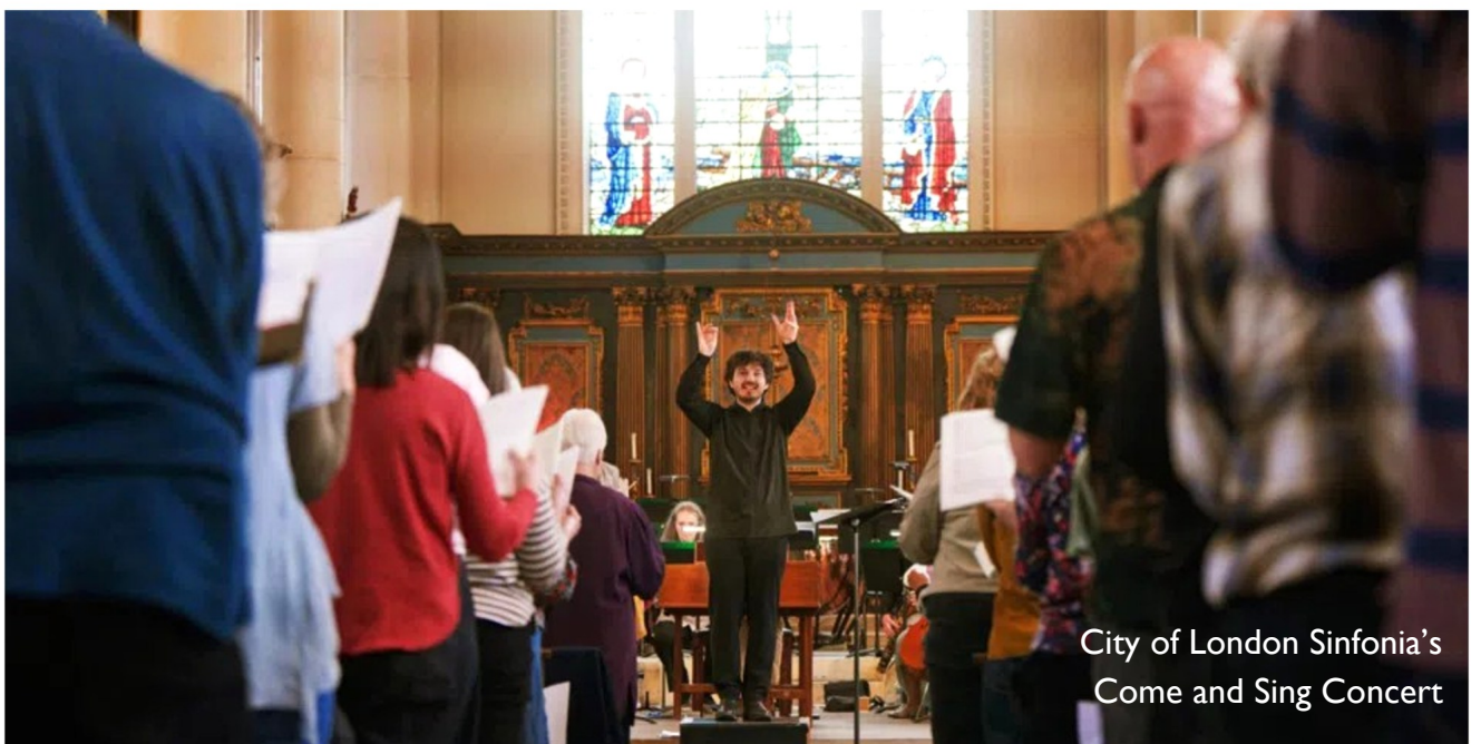
City of London Sinfonia's Come and Sing Concert

Sinfonia Cymru's Memo Mornings is a series of relaxed one-hour concerts at Memo Arts Centre, Barry. Featuring small groups of three to five of the best young classical musicians, there are no formalities at these one-hour concerts, and you can enjoy tea and cake along with the performance.