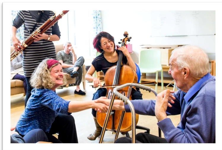
Scottish Chamber Ensemble's ReConnect programme

Scottish Chamber Orchestra will be marking the end of their 5 year residency in Craigmillar, Edinburgh with Tapestry , a vibrant showcase of the Craigmillar community's creativity and heritage. The residency has included an annual schools' programme for nursery, primary and secondary school pupils and year-round creative projects for all members of the community.