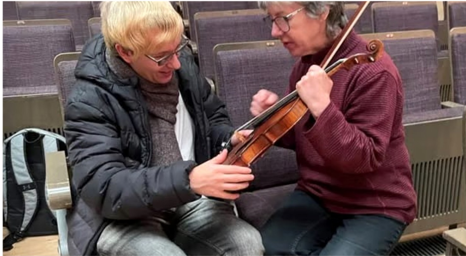
The Hallé's touch tours