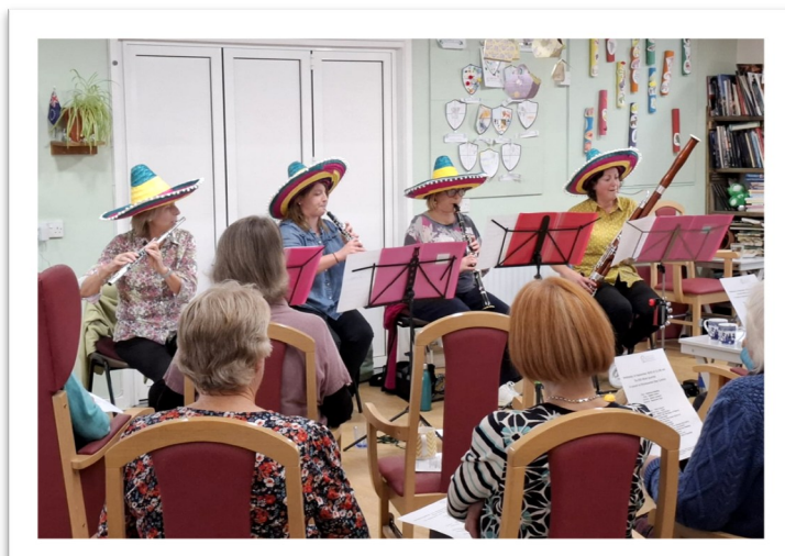
ESO dementia friendly concert