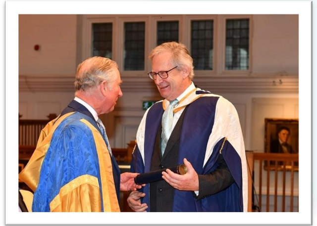
Former HRH The Prince of Wales presenting Sir John Eliot Gardiner with an Honorary Doctorate from the Royal College of Music.

Several ABO members will be participating in the Coronation of Their Majesties The King and Queen Consort in May 2023 including Monteverdi Choir , English Baroque Soloists and Royal Philharmonic Orchestra . To commemorate the Coronation, The Sixteen have also released a new album presenting 500 years of royal music .