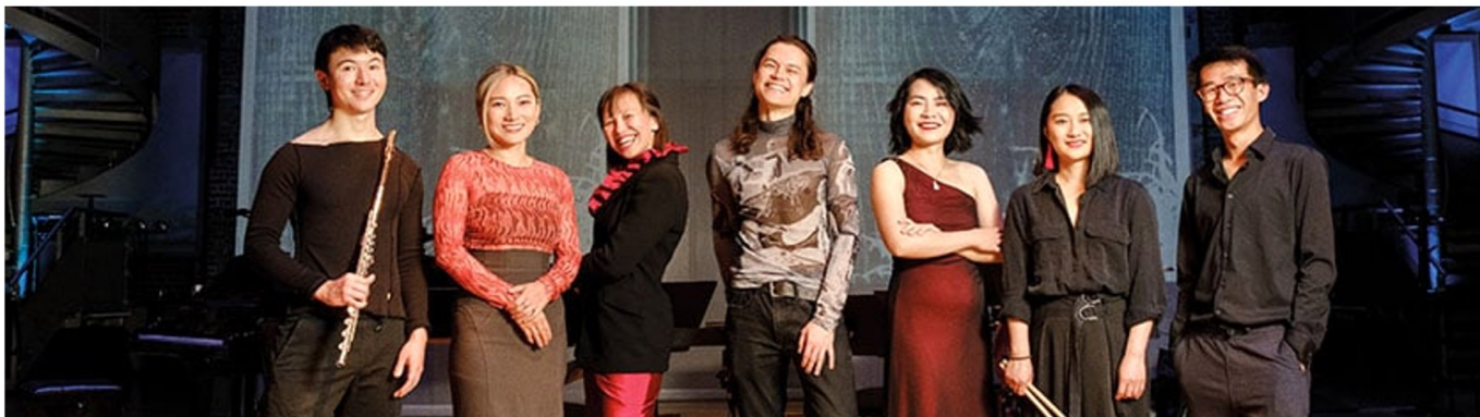
Introducing Tangram, Associate Artists at LSO St Luke's