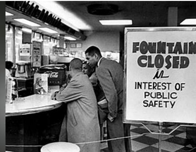
Peaceful Protest 1960