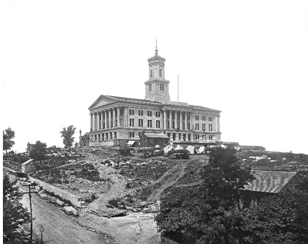
Civil War 1861-1865