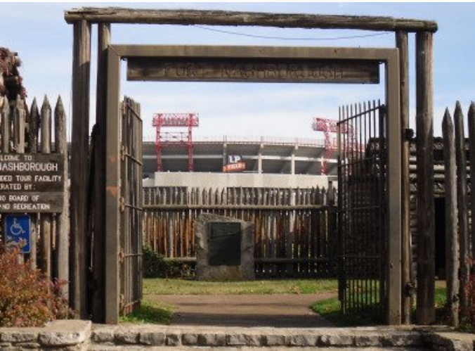
Fort Nashborough 1781