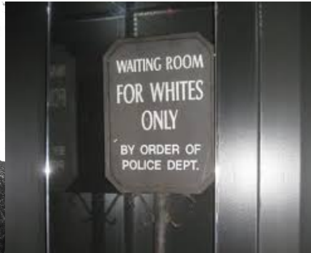
Segregation Active 1954