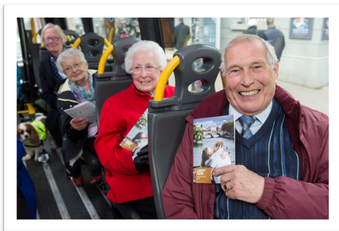
Ulster Orchestra Move to the Music