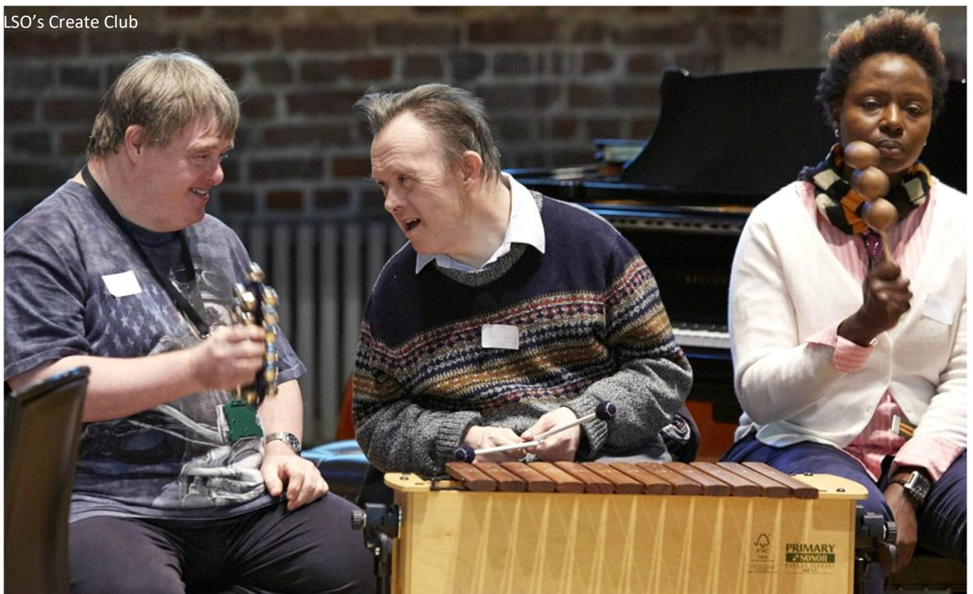
LSO's Create Club

The ABO made a submission to UK Government's forthcoming Spending Review. The submission makes 4 key recommendations to drive economic growth and break down barriers to opportunity, by safeguarding core investment in the UK's celebrated cultural sector; investing in access to high-quality music education and creative subjects and skills development for all children and young people; driving economic and regional growth through sustainable local funding for the creative arts across the country and; enhancing the effectiveness of Orchestra Tax Relief (OTR). You can see the full submission here.