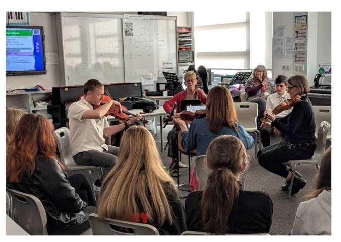
Scottish Ensemble's Music For Wellbeing