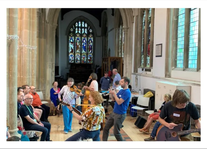
Sudbury Sounds with Sinfonia Viva