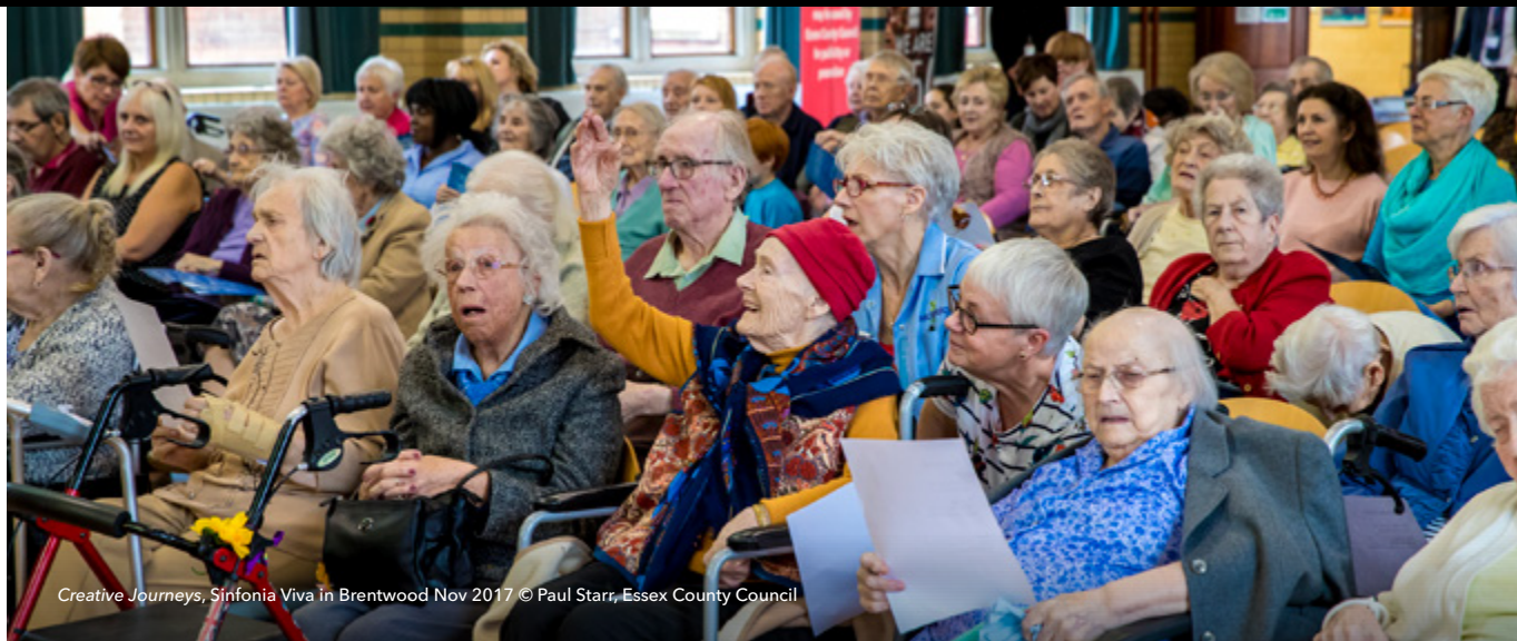
Creative Journeys, Sinfonia Viva in Brentwood Nov 2017

As with all our projects, we build CPD into the main project, rather than including it as a separate strand. With Creative Journeys , we began the project sessions with a planning session for the Viva team and lead staff members from each of the care homes, hosted by one of the homes. We worked together in this session to explore the ways we would work during the sessions and to think about the roles we would all take. We also created a short song together. The intention of this session was to establish the team as one whole team, to reassure care home staff about the process, and to get to know each other better. Care home staff were actively involved in all workshop sessions and the performance – and in most cases, delivered singing sessions in between the Viva sessions, to help support the work. The quality of the relationships established between the care home staff and workshop team has a significant impact on the quality and success of the work. This planning session was essential in developing that sense of team.