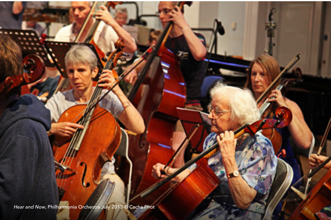
Hear and Now, Philharmonia Orchestra July 2013