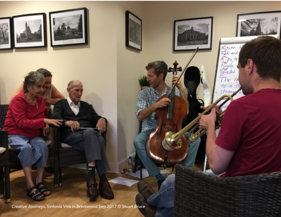
Creative Journeys, Sinfonia Viva in Brentwood Sep 2017