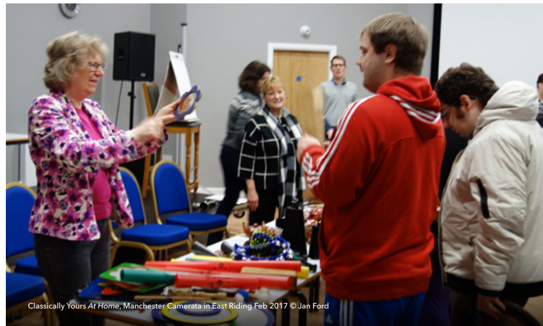
Classically Yours At Home, Manchester Camerata in East Riding Feb 2017

Established in 2008, ETO's Turtle Song project has been working with people living with Alzheimer's and dementia and their carers/companions, encouraging artistic and social interaction. Delivered in partnership with Turtle Key Arts, participants meet weekly for ten weeks to write their own song cycle with the help of professional musicians and Royal College of Music students, ending in a live performance for friends and family which is recorded as a DVD. Projects have run in Cambridge, Wolverhampton, Dulwich, Suffolk, Oxford, Stockton-on-Tees, Leeds, Norwich, Croydon, Reading and Newbury. http://englishtouringopera.org.uk/productions/turtle-song