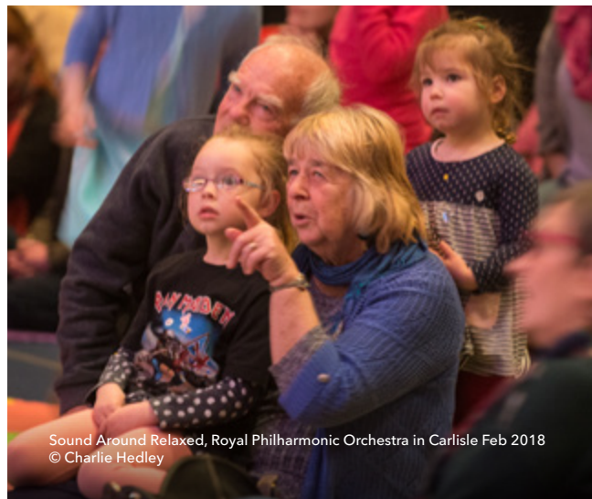
Sound Around Relaxed, Royal Philharmonic Orchestra in Carlisle Feb 2018