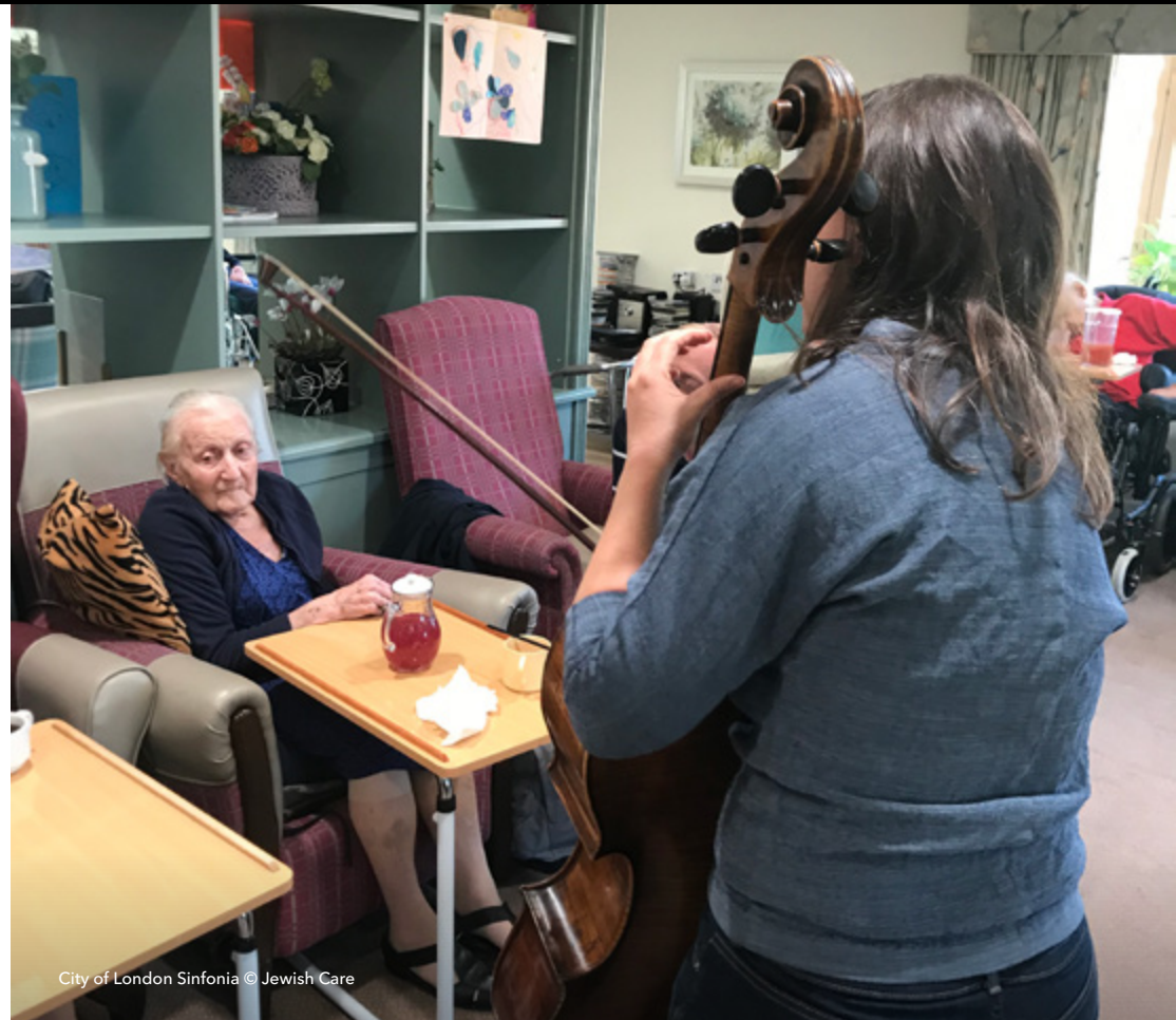
City of London Sinfonia

Although the project work of the CBSO in working with people with dementia has not yet been formally evaluated, the learning gained from working in close partnership with Extra Care, combined with the experiences of residents, their families, staff and the players during project sessions has impacted upon the organisation’s artistic and creative vision, already influencing work in the concert hall through the delivery of dementia-friendly concert performances and dementia-friendly training for all staff at the organisation.