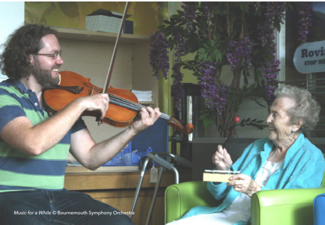
Music for a While

At any point a quarter of all acute hospital beds are in use by people with dementia and improving their care in hospital continues to be a national level strategic priority. People with dementia may be in an acute hospital for a range of reasons, typically as result of breaking a bone, or an infection. In many cases they may have multiple problems. The severity of their dementia will range from undiagnosed to severe. Their length of stay in hospital will vary but typically is longer than someone with the same condition who does not have dementia. Time spent in an acute hospital environment tends to have a negative impact on people with dementia's ability to live independently. All of these factors have cost implications for the NHS and Adult Social Care.