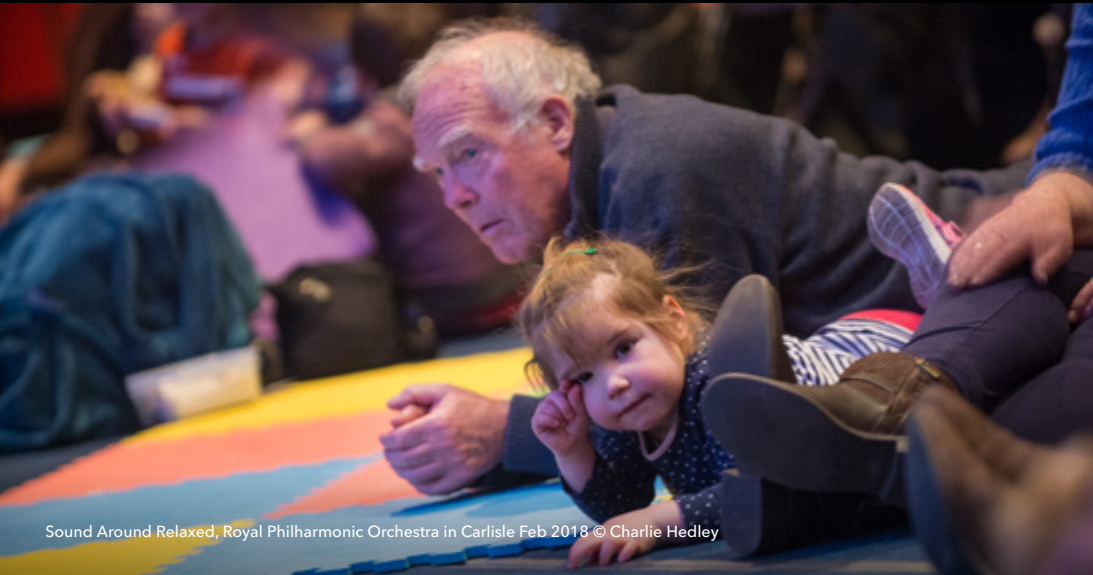
Sound Around Relaxed, Royal Philharmonic Orchestra in Carlisle Feb 2018