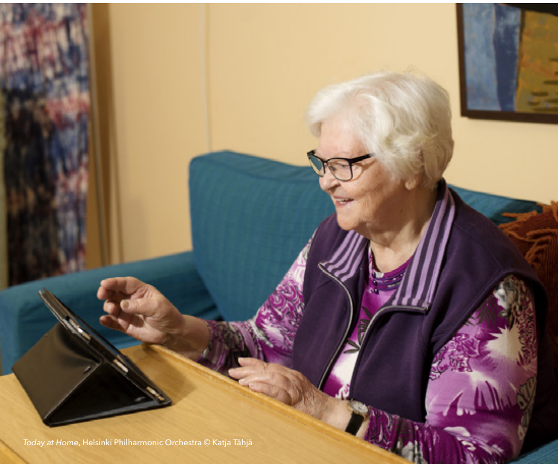
Today at Home, Helsinki Philharmonic Orchestra